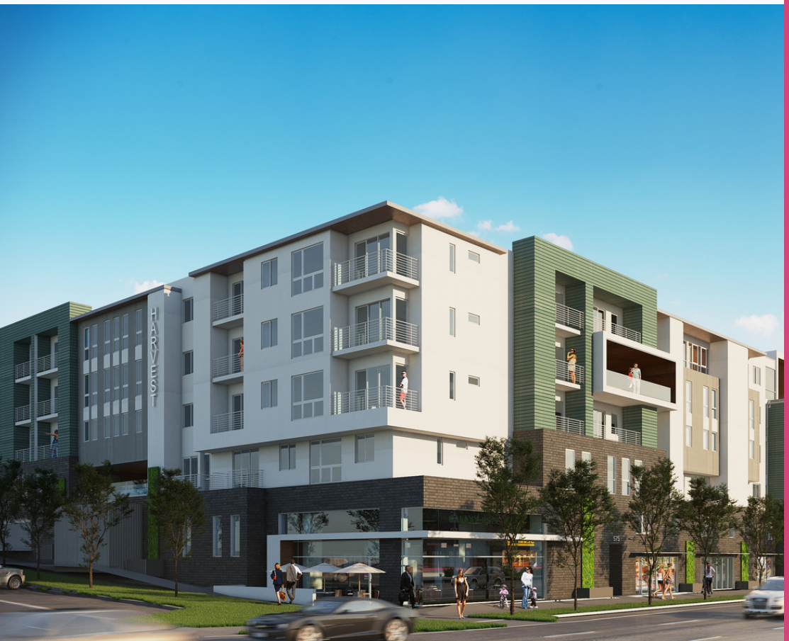
*THIS IMAGE IS A CONCEPTUAL RENDERING THAT IS SUBJECT TO CHANGE